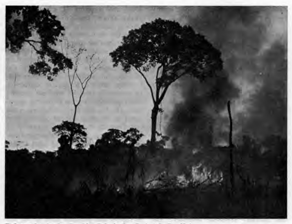
Deforestation in the Cuyubim Colonization Project in Rondônia.

The irrigated rice scheme at Jari is a unique attempt to use the Amazonian várzea (floodplain) for agribusiness ventures. When Jari abandoned rice cultivation in 1988, the plantation had 4,150 ha of rice; plans to expand to 12,700 ha never were realized (Fearnside, 1988; Fearnside and Rankin, 1980, 1982b, 1985). The expansion of irrigated rice to much wider areas in