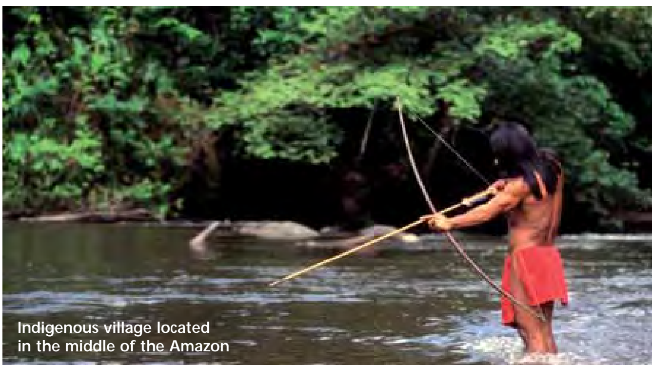
Indigenous village located in the middle of the Amazon

The UN Climate Convention needs to agree upon a definition of "dangerous climate change": as soon as this will happen the debate will change completely, because from the perspective of a world that is committed to containing the global total within a set threshold, then overall planetary carbon emissions will become the main factor. Without all the things that fall through the cracks of the Kyoto Protocol, without worrying about who is responsible for what but rather about reducing emissions wherever possible, as much as possible. The forest is extremely important in this perspective. ■