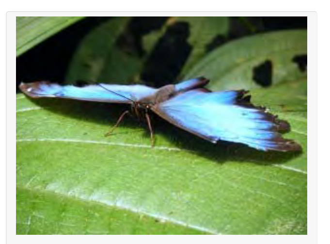
A Blue Morpho butterfly resting on a leaf in the Amazon

The Belo Monte Dam itself has substantial impacts. It is unusual in not having its main powerhouse located at the foot of the dam, where it would allow the water emerging from the turbines to continue flowing in the river below the dam. Instead, most of the river's flow will be detoured from the main reservoir through a series of canals interlinking five dammed tributary streams, leaving the "Big Bend" of the Xingu River below the dam with only a tiny fraction of its normal annual flow.