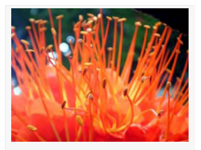
Plant life, Amazon rainforest

In February 2010, Belo Monte was granted a 'partial' license to allow installation of the construction site without completing the environmental approval of the project as a whole. Partial licenses do not exist in Brazil's legislation, and this device represents a step in allowing dam projects to make themselves into faits accomplis irrespective of their impacts. In January 2011 a preliminary license was granted, with 40 'conditionalities' that would have to be met before an installation license would be granted to build the dam.