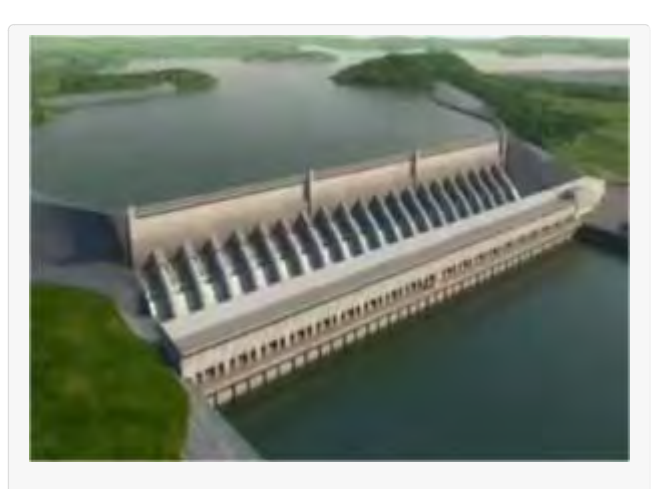
CGI rendition of the proposed main dam

The official scenario for the Xingu River changed in July 2008 when Brazil's National Council for Energy Policy (CNPE) declared that Belo Monte would be the only dam on the Xingu River. However, the council is free to reverse this decision at any time. Top electrical officials considered the CNPE decision a political move that is technically irrational<sup>10</sup>. Brazil's current president blocked creation of an extractive reserve upstream of Belo Monte on the grounds that it would hamper building "dams in addition to Belo Monte"<sup>11</sup>. The fact that the Brazilian government and various companies are willing to invest large sums in Belo Monte