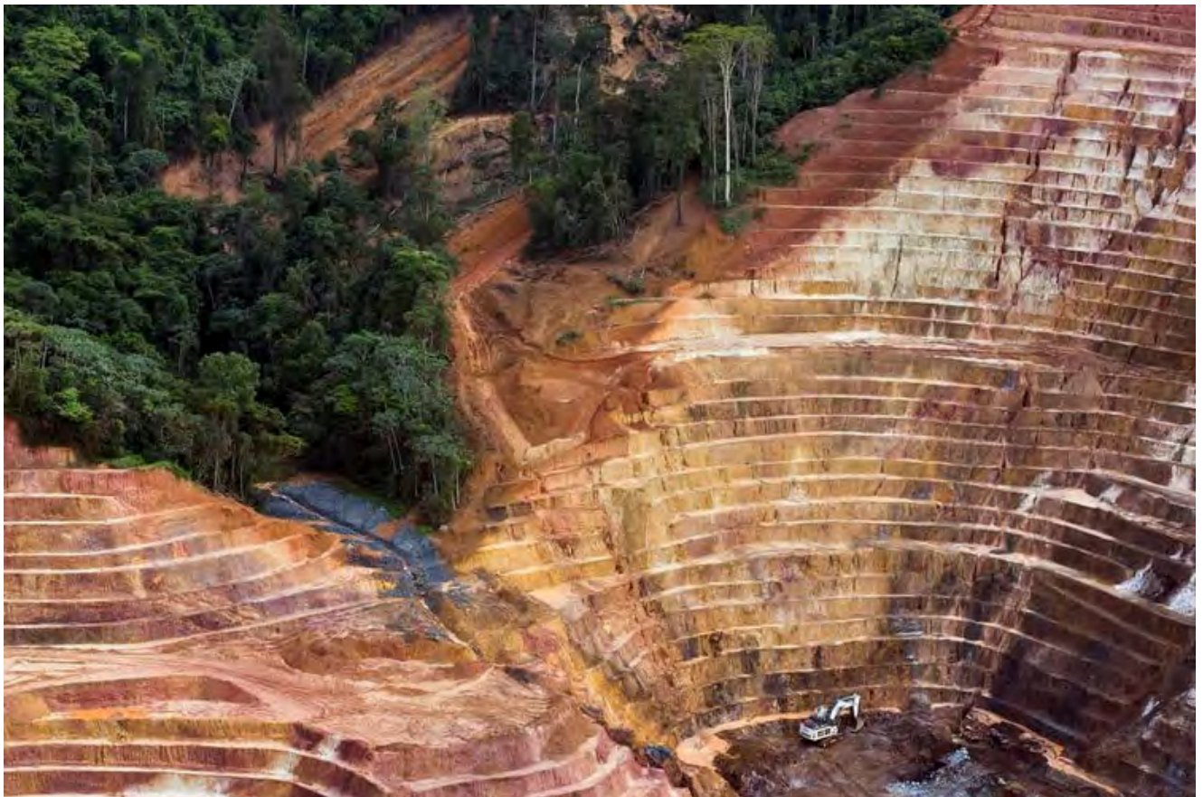
Mine September 26, 2017 /Bill Laurance

In Brazil as in Ecuador, Peru, Colombia, and far beyond, aggressive miners and the lethal spider-webs of roads they bulldoze are opening up far larger areas of forest for exploitation and destruction.