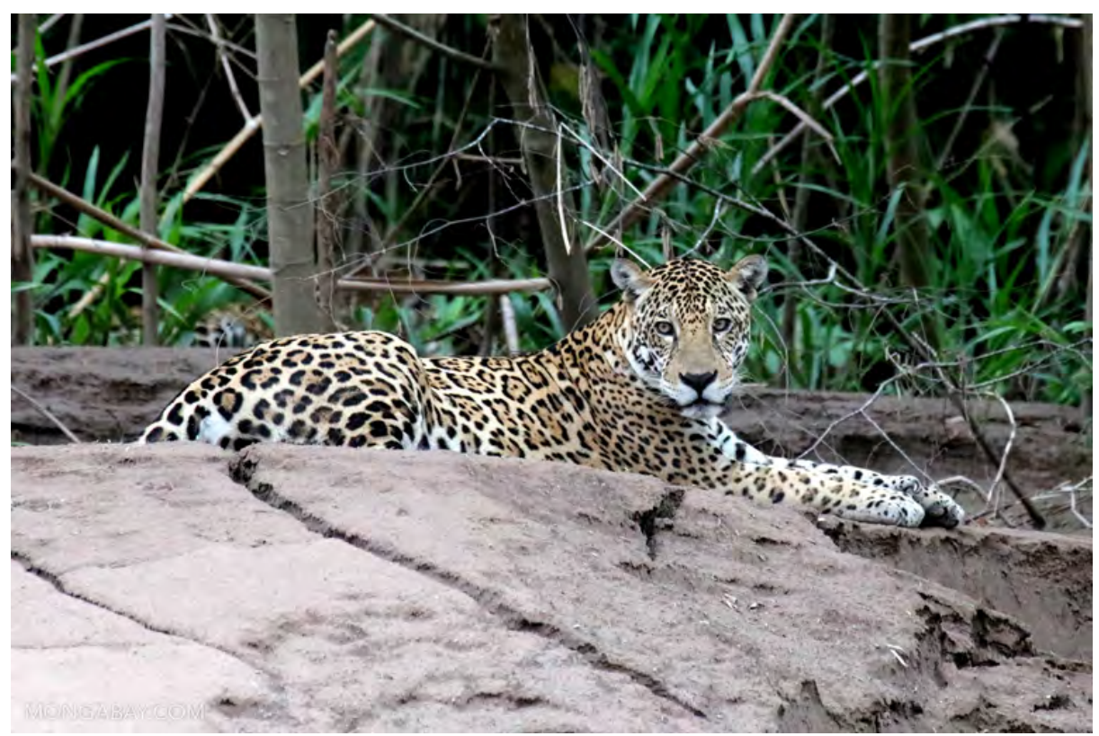
Should he be elected and follow through with his campaign pledges, Bolsonaro could pose a major threat to Amazon biodiversity, Brazil's environment, and indigenous and traditional peoples.

Bolsonaro's proposal for Brazil to <u>abandon</u> the Paris Agreement on controlling global warming is one of the threats with the most <u>irreversible consequences</u>. The Amazon rainforest faces a frightening process of degradation through fragmentation, logging, major droughts, floods and windstorms, forest fires and biological invasions of lianas and bamboo. In addition to these consequences, there are losses from <u>deforestation</u>, whose annual rate increased by 52 percent from 4,571 to 6,947 square kilometers (1,765 to 2,682 square miles) between 2012 and 2017. Tipping points for the Amazonian forest are already very close, both from the advance of <u>deforestation</u> and from increase in global <u>temperature</u>.