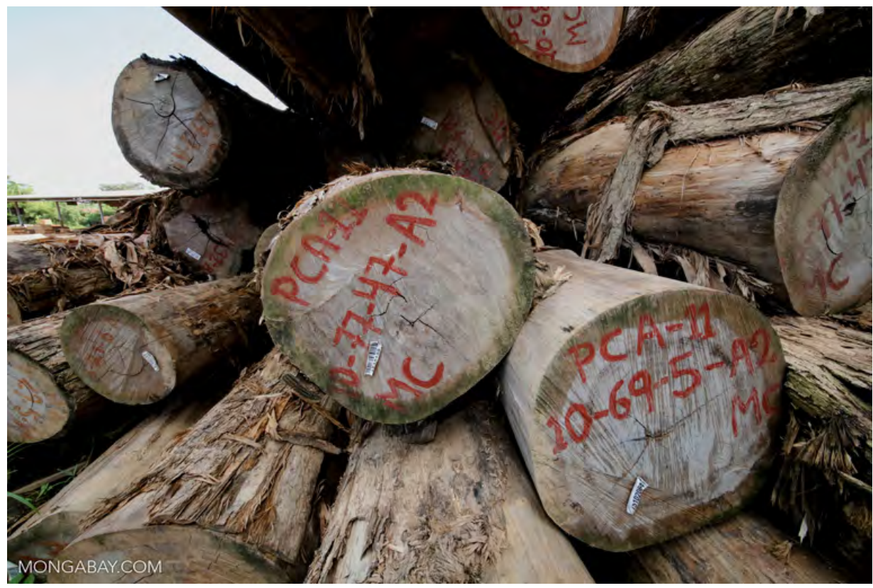
Bolsonaro's promise to abolish the environmental ministry and pull out of the Paris Climate Agreement could lead to rampant deforestation, and even runaway climate change.

of <u>presidential debates</u>. This is a formula for irreversible degradation in the Amazon, in addition to tragic impacts worldwide.