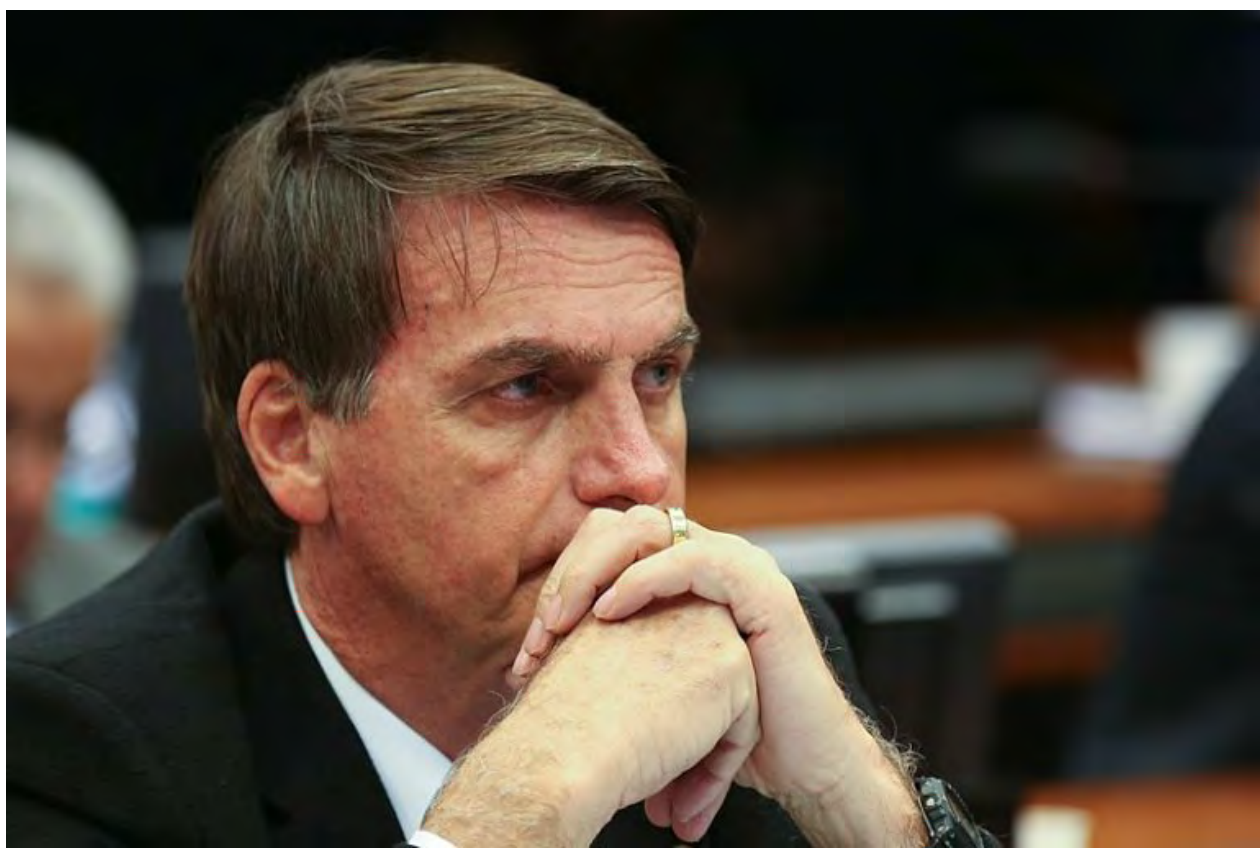
Jair Bolsonaro.

A Portuguese-language version of this commentary is available on Amazonia Real <u>here</u>.