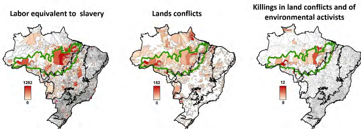
Fig. S2. Brazil's labour "equivalent to slavery" (2008-2016), land conflicts (2010-2016) and killings in land conflicts and of environmental activists (2008-2016). The area outlined in green is the "arc of deforestation".