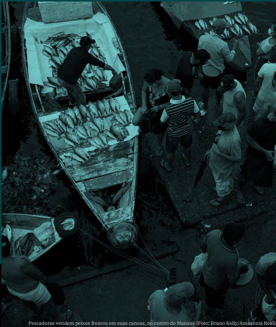
Pescadores vendem peixes frescos em suas canoas, no centro de Manaus

Drivers and impacts of changes in aquatic ecosystems