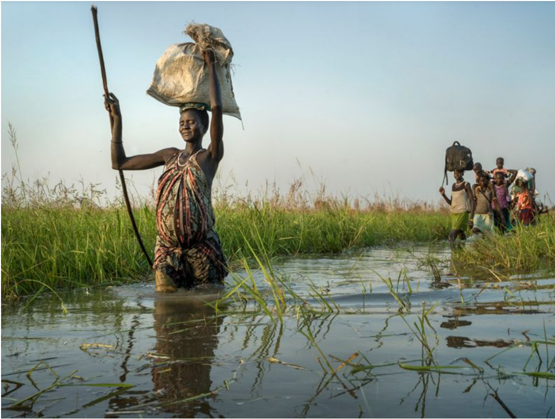
Wetlands, such as this one in South Sudan, are often neglected in emissions models.