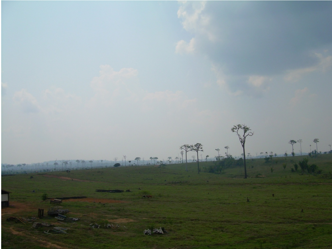
Figure 51.2. Cattle pasture in large and medium properties is the dominant land use in deforested areas. Here, grileiros (illegal landgrabbers) have established large ranches in the municipality of Lábrea (in the state of Amazonas) in an area with access by a privately constructed side road connected to the BR-364 Highway in Rondônia.