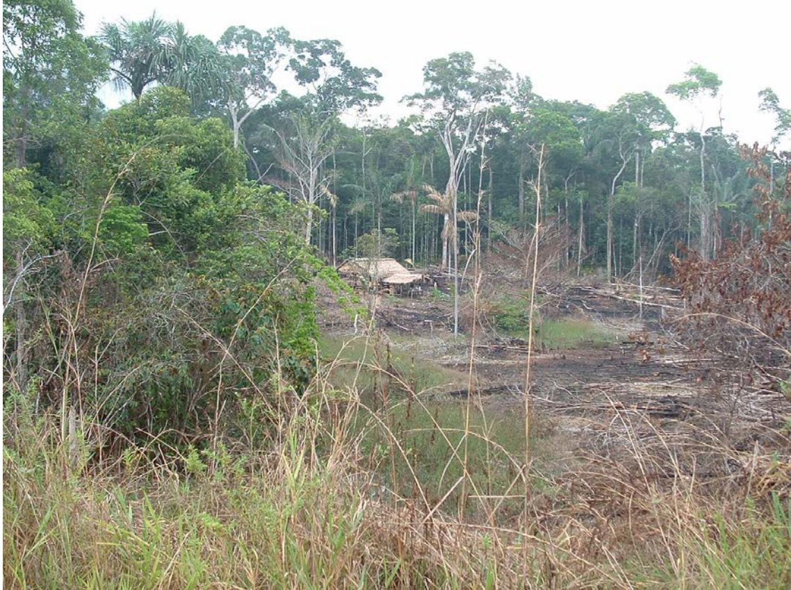
Figure 51.1. Squatters near the BR-319 (Manaus-Porto Velho) Highway. Squatters, including organised landless farmers ( sem terras ), are one of several groups of actors that deforest when roads are built. (Photo: P. Fearnside).

fraud) (Fig. 51.2) (Fearnside 2008). A 2009 Brazilian law allowing illegal claims of up to 1500 ha to be legalised represents a setback in a transition to a land-tenure system based on the expectation that illegal invasions will not be rewarded.