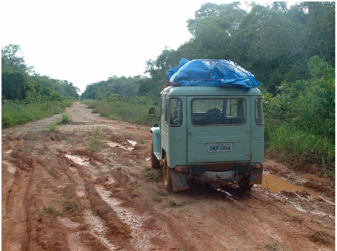
Figure 51.4. The BR-319 (Manaus-Porto Velho) Highway was abandoned in 1988 and is a barrier to human migration. Its planned reconstruction would connect central and northern Amazonia with the ‘arc of deforestation’ where clearing has been concentrated along the southern and eastern edges of the Amazon forest (see Fig. 51.3).

deficiencies in the environmental licensing and decision-making process provide ample lessons for those who are willing to listen (Fearnside & Graça, 2006).