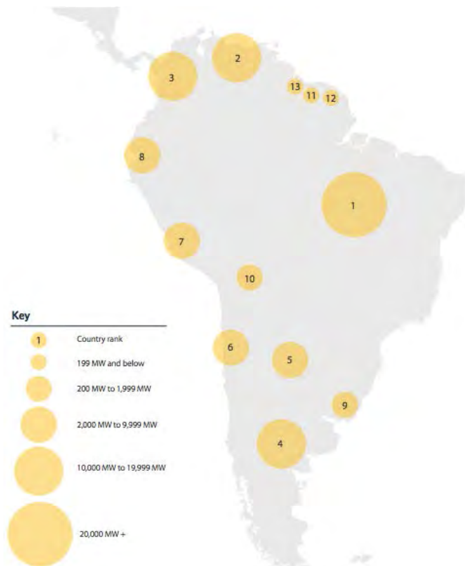
Image 1. Installed capacity in South America

Source: International Hydropower Association. 2018. Hydropower Status Report: Sector Trends and Insights . London: IHA.